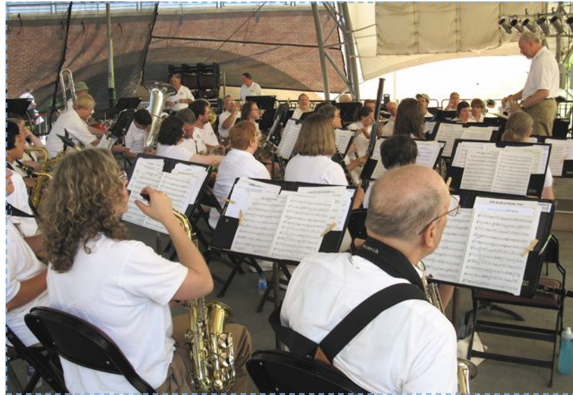
On stage in Charlottesville, July 2

The Fourth of July concert was rained out—make that “torrent-ed out” as intense storms broke over Blacksburg after the parade. Band members who had made it out to Caboose Park met in a shelter and had some good food and fellowship—if a bit soggy!